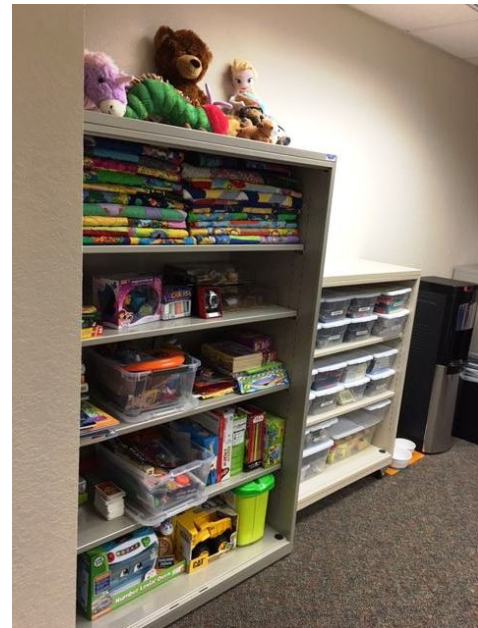
"Kitchen" AFTER: They didn't really need this space for kitchen items anyway. We moved toys for kids and office supplies here so that they would be really handy for staff to make use of.