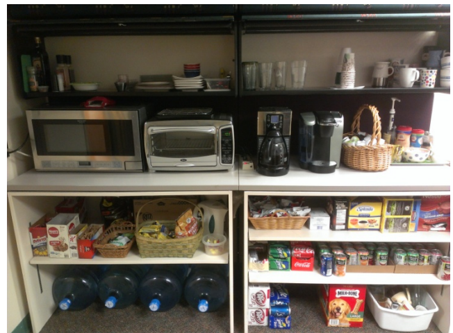
Kitchen AFTER: That's better! When everything has a designated "home" it's easier for everyone to put things back where they belong. This is especially important when there are lots of people using a space.