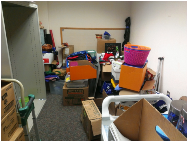
Storage Room BEFORE: A jumbled mess of both useful and useless items.