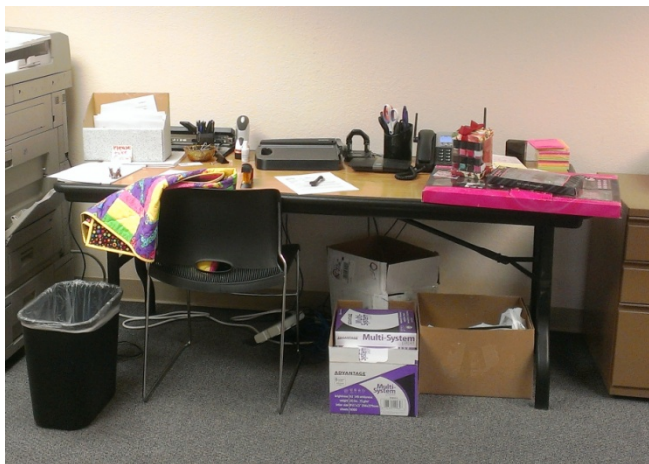
Copy Station BEFORE: Big table, big mess.