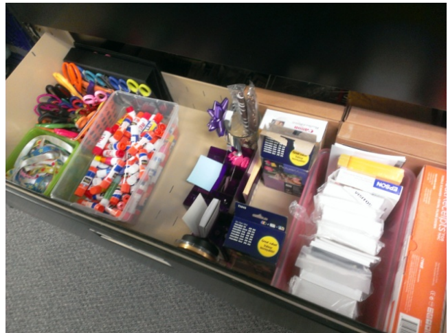
We found space in a cabinet drawer for the Life Book supplies.