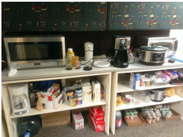
Kitchen BEFORE: Doesn't look too bad, but things were stored haphazardly and it was hard to find what you were looking for. Also, not knowing what you have can lead to re-buying and overbuying.