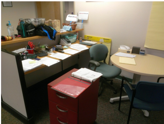
Front Desk BEFORE: Not very welcoming for staff, visitors, volunteers, and trainees.