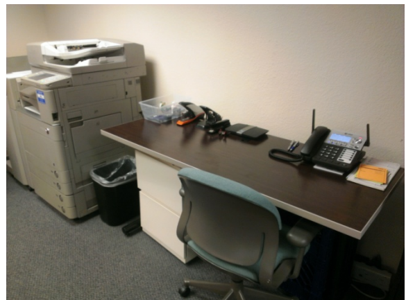
Copy Station AFTER: Smaller desktop and organized supplies provide MORE room for laying out copy projects. It's also a spare desk when needed.