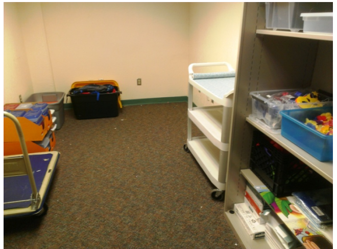
Storage Room AFTER: Except for the hand cart, everything on the left is designated for an upcoming event and will soon be gone.