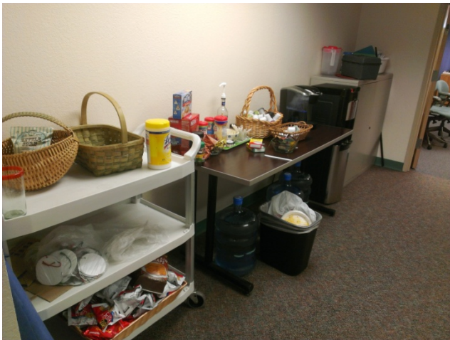
"Kitchen" BEFORE: A bunch of random stuff, not all of which was actually needed or wanted.