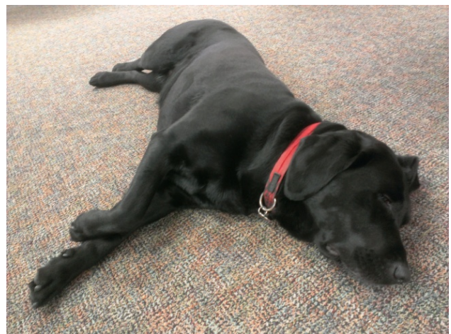
Cassie was a big help and gives the project two paws up!