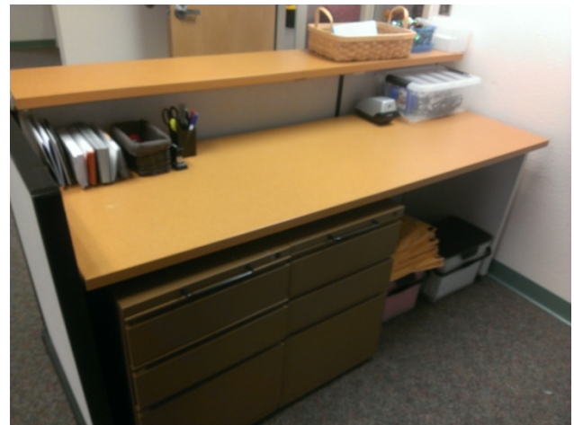
Front Desk AFTER: Only the things that are needed for classes are left out, with storage for instructors' materials underneath.